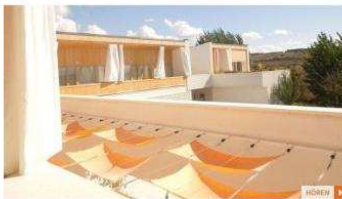
Hotel Gračanica: Schweizer Geld und kosovarische Tradition.

Hotel Gračanica, Ul. Dragana Ristića b.b., 10500 Gračanica Tel. +381 (0)38 729 888 Mob. +386 (0)49 764 000 Business No. 70703211 - Fiscal No. 600601597 - VAT No. 330099491 ProCredit Bank IBAN XK05 116 700 163 800 0148